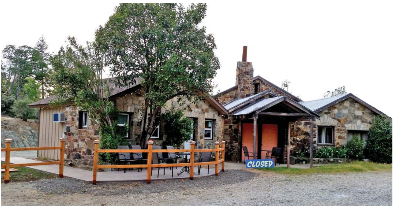
The Rock House in 2015