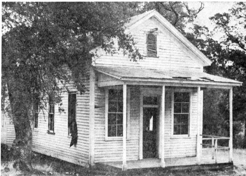
Oregon City School—saved from destruction