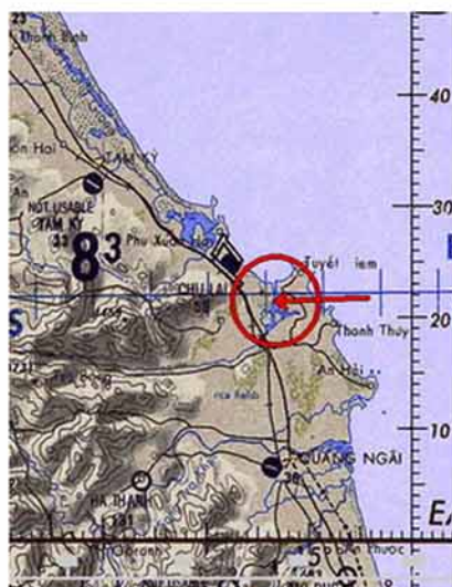
Added by Eddieb