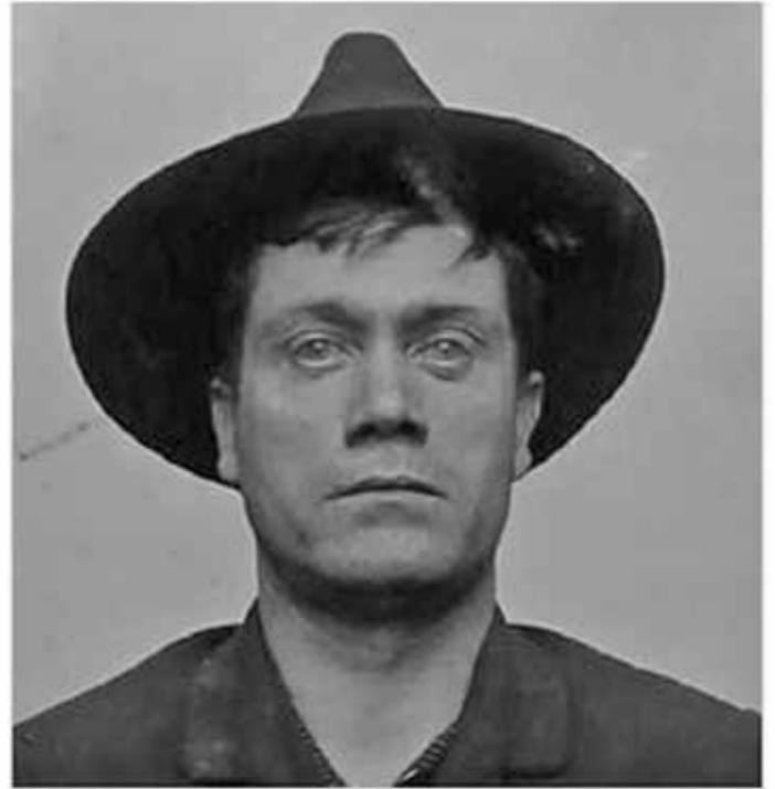
Burial at Gridley-Biggs Cemetery