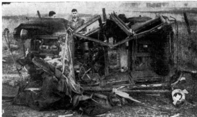
WHEN DEATH STRUCK AT CROSSING