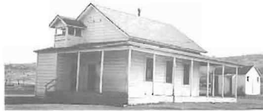
Messilla Valley School, circa 1962

11666 Concow Rd. P.O. Box 4031 Yankee Hill, CA 95965 530-533-4132